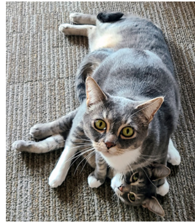
Leo sitting on Kona