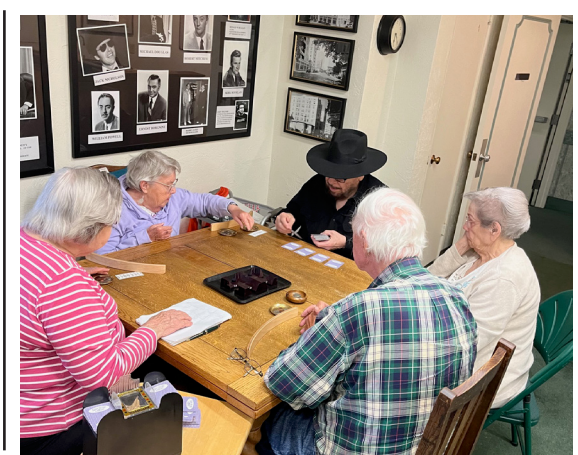
Evening card players in the Billiard Room