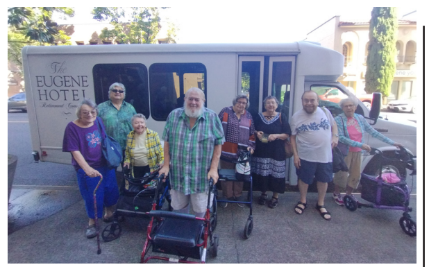
Residents headed out on a day excursion