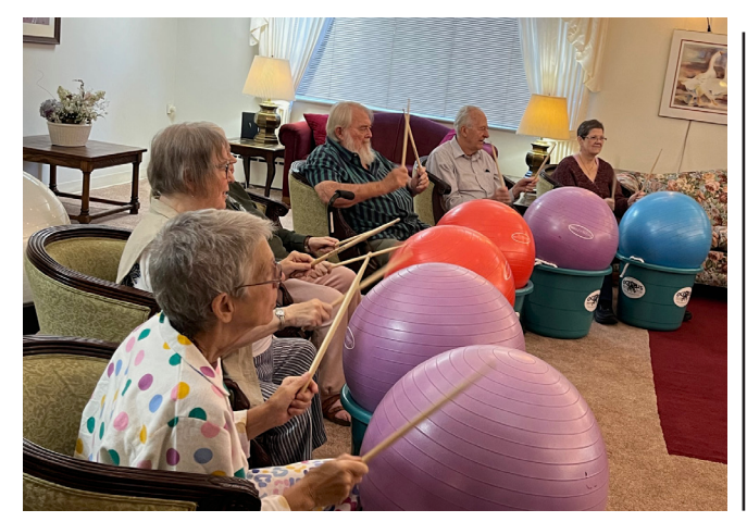
Yoga Ball Drumming in the Lounge