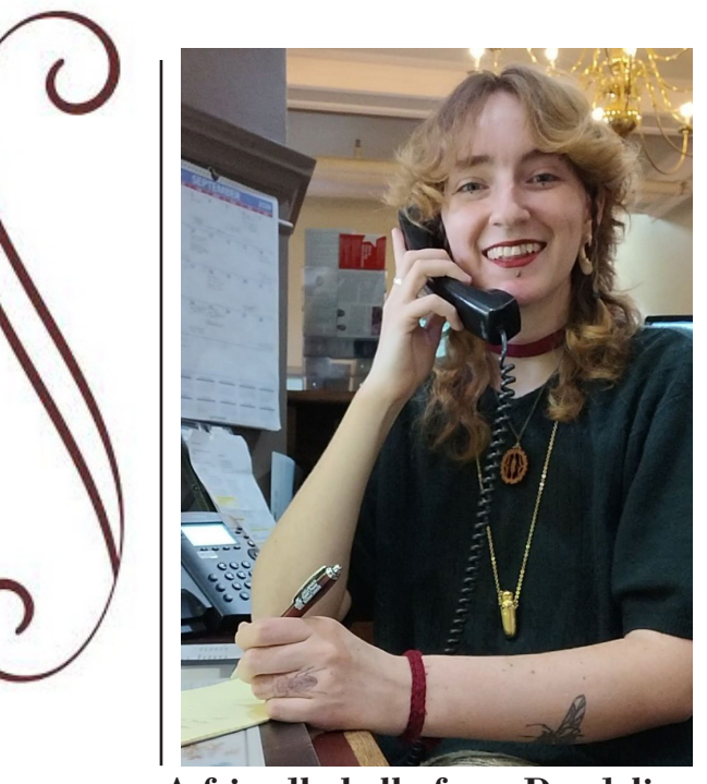
A friendly hello from Dandelion at the Front Desk